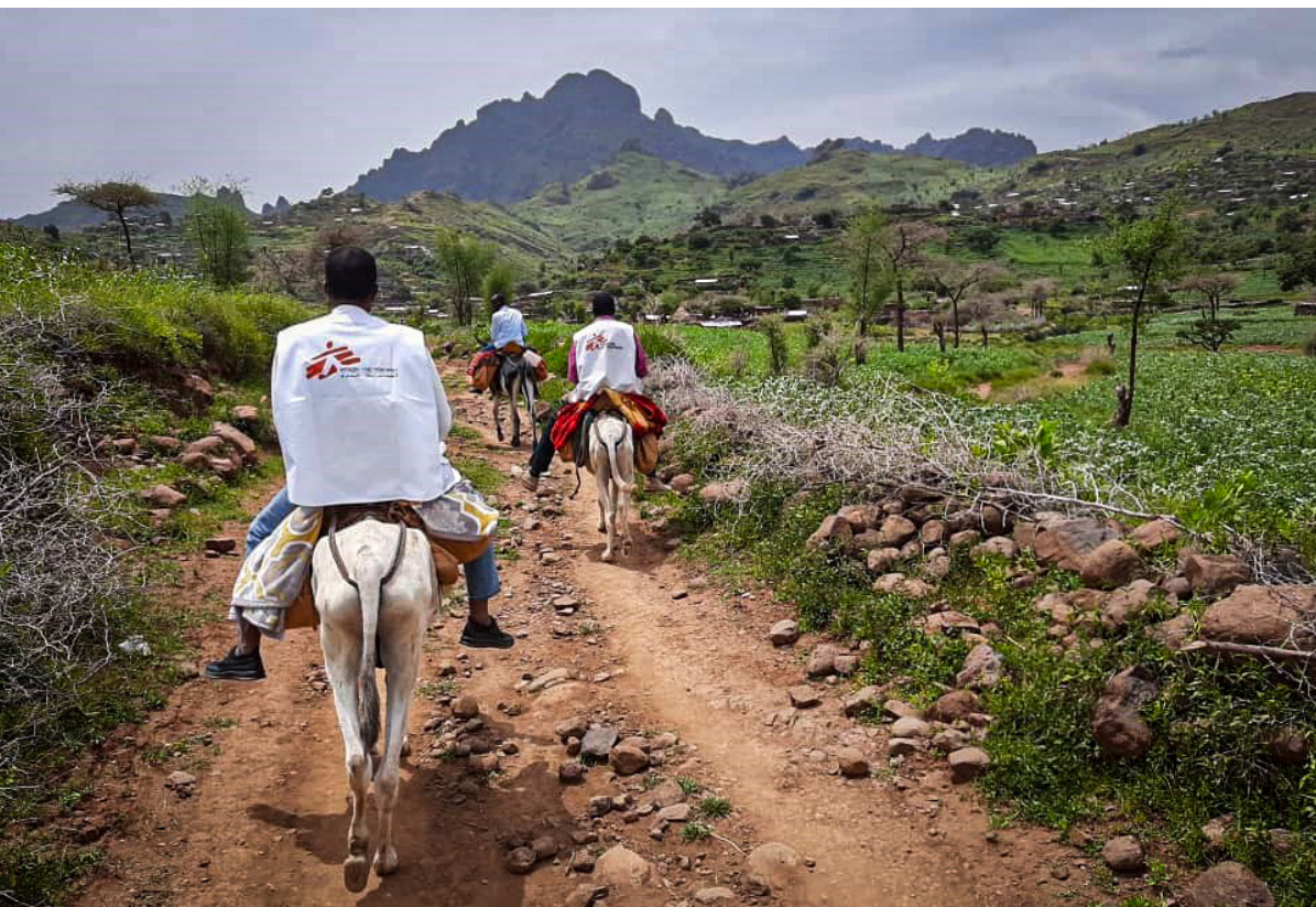
SUDAN: MSF staff travel by donkey to Umo, a remote, mountainous area of central Darfur. In 2020, MSF launched a project in the nearby Rokero health center offering medical services in the emergency room, the inpatient department, and the maternity and neonatal departments.