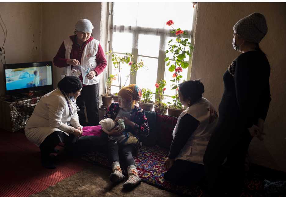
KYRGYZSTAN: An MSF pediatrician, a health promoter, and a Ministry of Health nurse visit a mother and her eight-day-old newborn for an at-home postnatal consultation in Syrt. For the past four years, MSF has worked in remote areas providing medical assistance, repairing existing medical equipment, and training local staff.