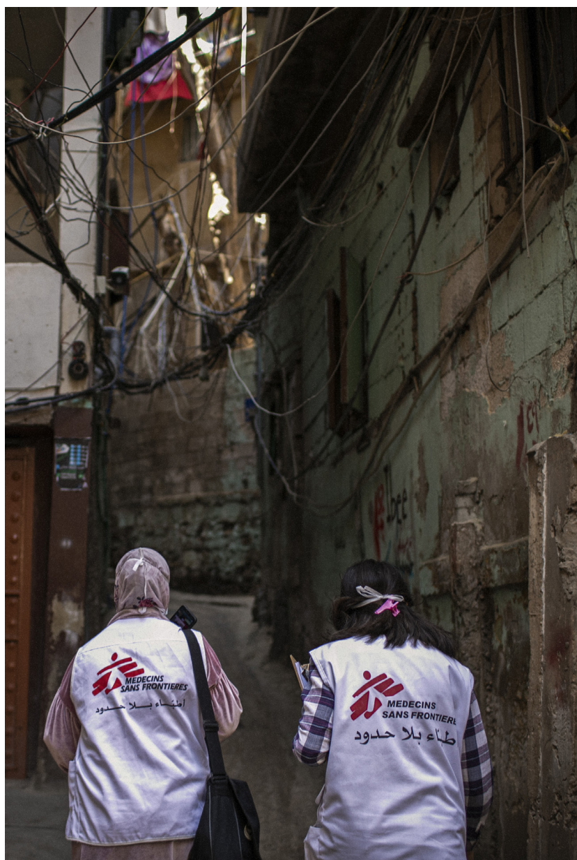
LEBANON: An MSF team conducts home visits to help contain the spread of COVID-19 in Burj al-Barajneh camp, Beirut.