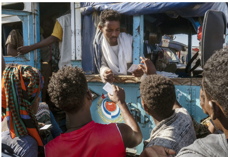
SUDAN: Refugees prepare to board the buses that will transfer them from Al Hashaba transit camp to Um Rakuba refugee camp, two of the three camps near the Ethiopian border where MSF provides medical care along with water and sanitation services.