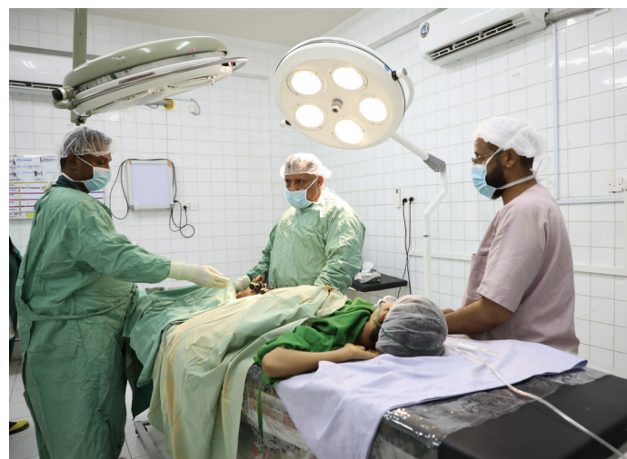
YEMEN: Orthopedic surgeons at work in the operating theater of the MSF-supported Al Salakhana hospital in Hodeidah. In 2020, MSF teams here admitted more than 1,500 patients for surgeries.