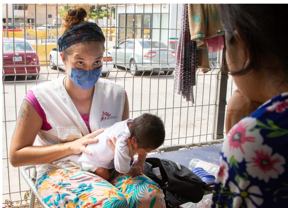
MEXICO: At an improvised camp for refugees and asylum seekers on the Rio Grande, an MSF doctor conducts a postnatal care consultation with a mother and her newborn. The COVID-19 pandemic has hampered the already arduous asylum process and left many families in dangerous limbo.