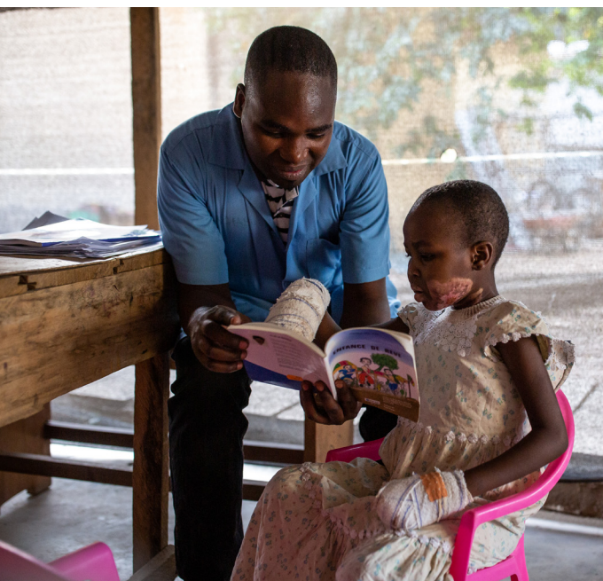
CAMEROON: A staff member works with a young patient at Maroua General Hospital. Since 2015, MSF has been providing nutritional care, emergency surgery, and mental health care services to people affected by conflict in the region.