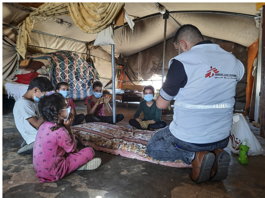
OCCUPIED PALESTINIAN TERRITORIES: An MSF health educator prepares an activity to teach children about COVID-19 in Masafer Yatta, a collection of 19 Palestinian hamlets in the Hebron Governorate of the southern West Bank.