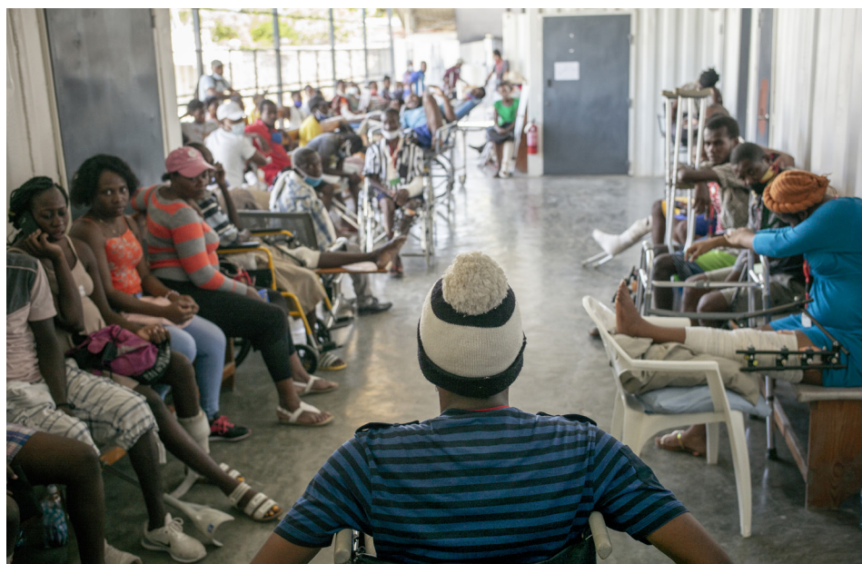
HAITI: The outpatient department of MSF's Tabarre trauma hospital, which sees approximately 80 patients a day. People who are discharged from the hospital come back for follow-up appointments, including wound care and physiotherapy sessions.