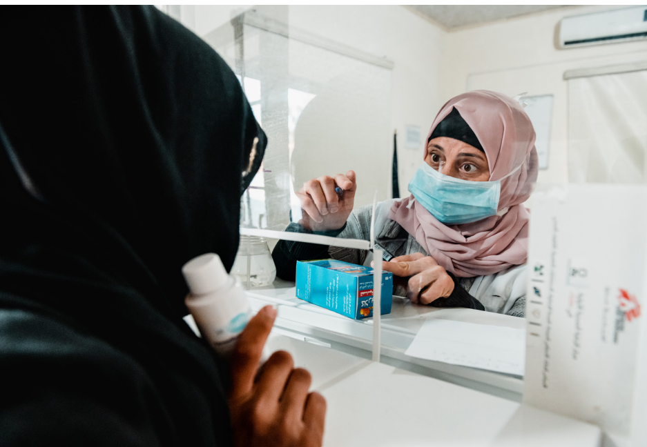
LEBANON: After her medical consultation, a woman picks up her medication at MSF's clinic in Hermel, where we offer medical care for patients with non-communicable chronic diseases, acute pediatric consultations, sexual and reproductive health services, and mental health care.