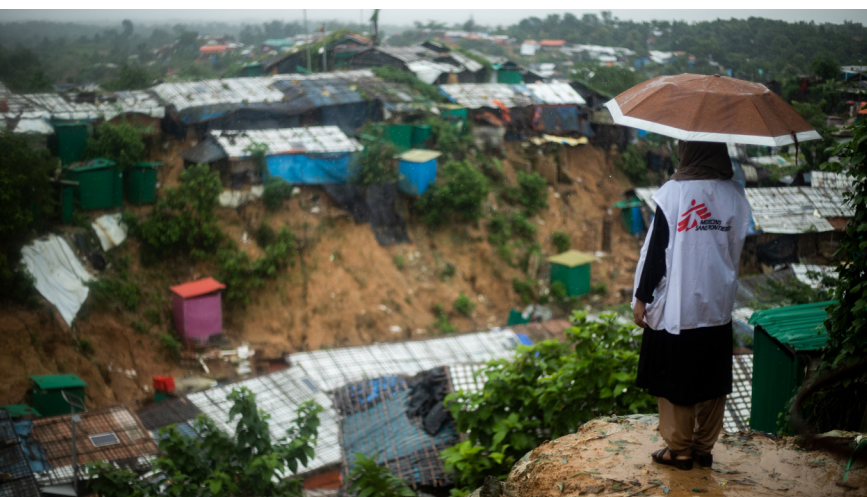
BANGLADESH: An MSF team member looks out over Jamtoli refugee camp, part of the massive complex of camps in Cox's Bazar where hundreds of thousands of Rohingya people settled after fleeing violence and persecution in neighboring Myanmar. Throughout Cox's Bazar, MSF manages 10 hospitals and primary health centers, providing essential care even during the monsoon season and throughout the COVID-19 pandemic.